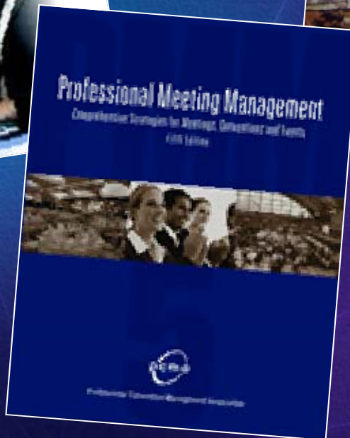
5 th Edition PCMA Manual