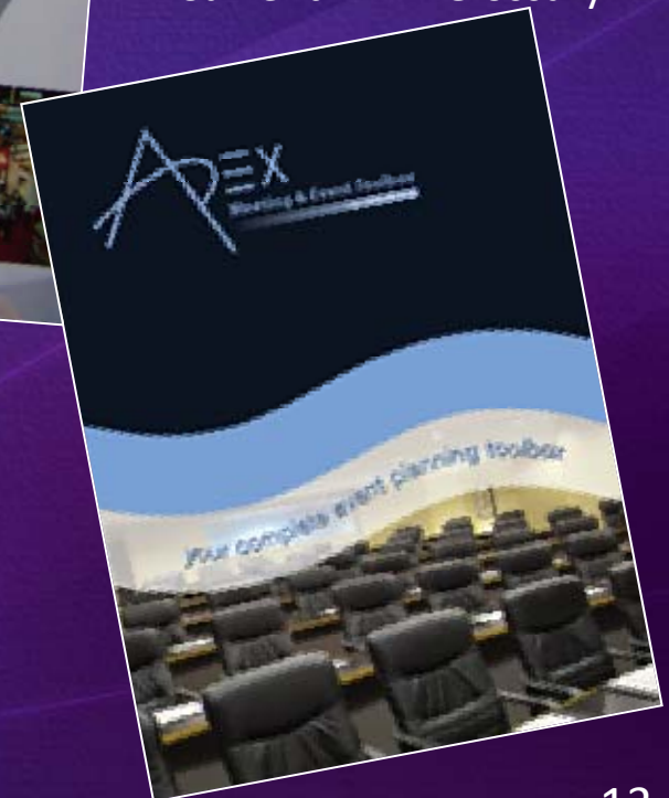
Current APEX Glossary