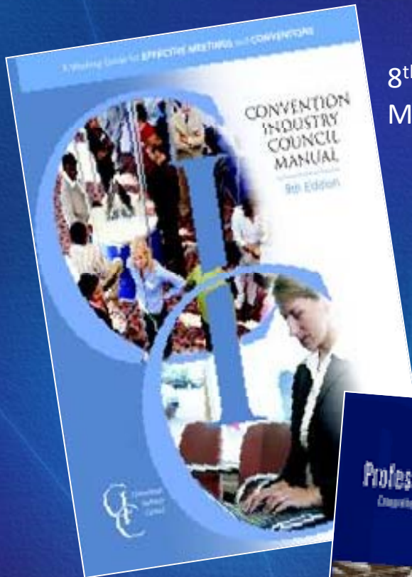
8 th Edition CIC Manual