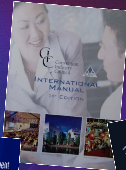
1 st Edition CIC International Manual